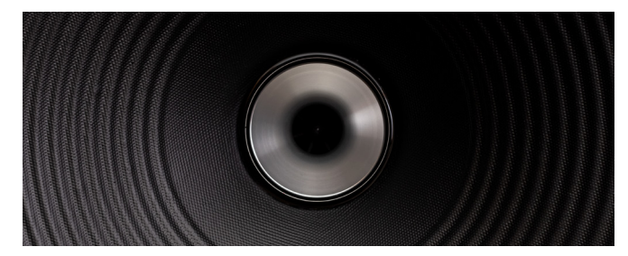
Figure 5. Custom made Vestlyd driver.