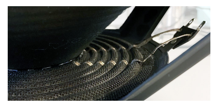
Figure 4: Voice coil lead out wires are attached to the spider for highest reliability at even high excursions

The tweeter waveguide, the custom made silver part you see in the center of the woofer, is machined from solid aluminum.